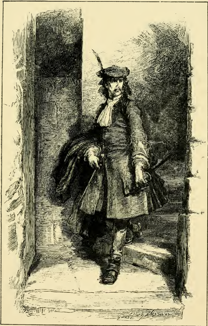
The Master of Ravenswood.